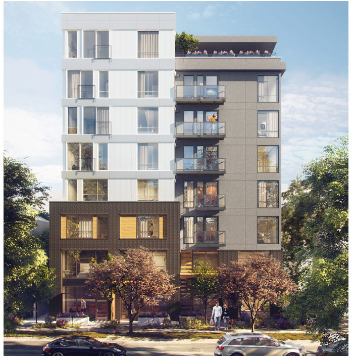
11th Ave Apartments Capitol Hill, Seattle