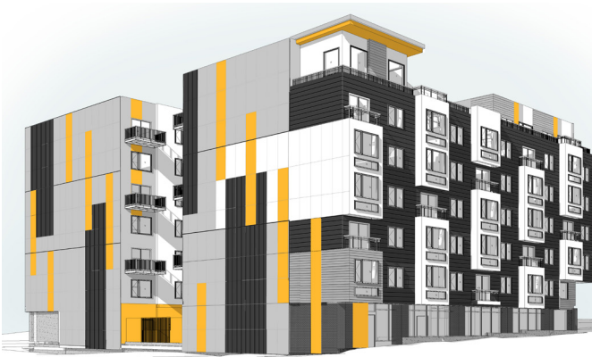
Amalfi Lake City, Seattle