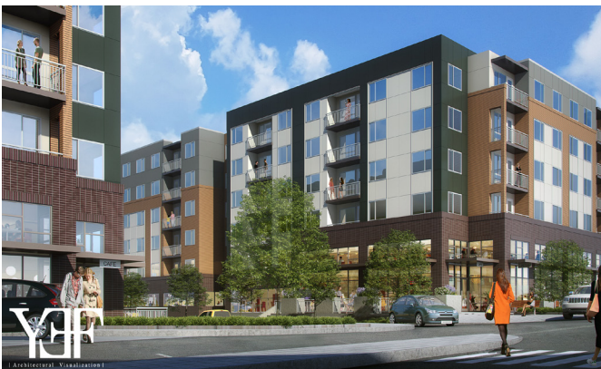
Solera Renton, WA