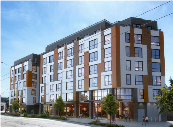
Beacon Crossing Beacon Hill, Seattle