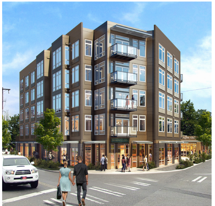
Ross Flats Fremont, Seattle